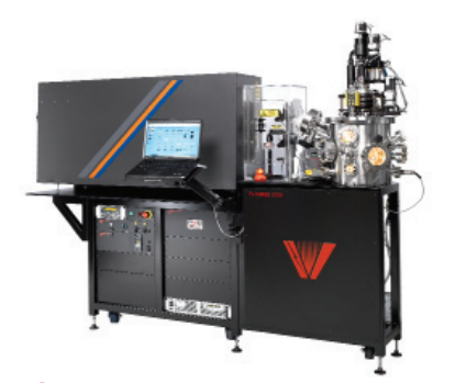
PLD/MBE 2100 Deposition System With COMPex 200 series laser

Dual wafer load lock Additional MFCs RF bias on substrate holder Magnetron sputter sources with RF or DC supplies Atom and ion sources Effusion cells Beam attenuation packages