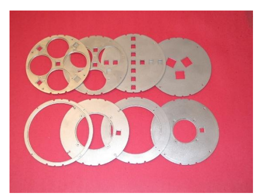
Various Substrate Holders

Operational Wavelength: 248 nm (KrF) or 193 nm (ArF) others available on request. PVD Products recommends a minimum of a 30 watt excimer laser for these systems.